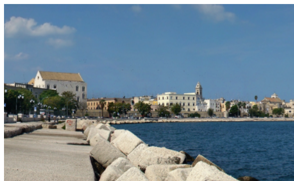
Our next event will be held in the port city of Bari in the Italian coast of the Adriatic Sea.

Your feedback and suggestions are always welcome!